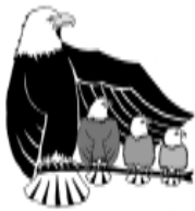
Ferndale High School Band, Orchestra, Color Guard Boosters